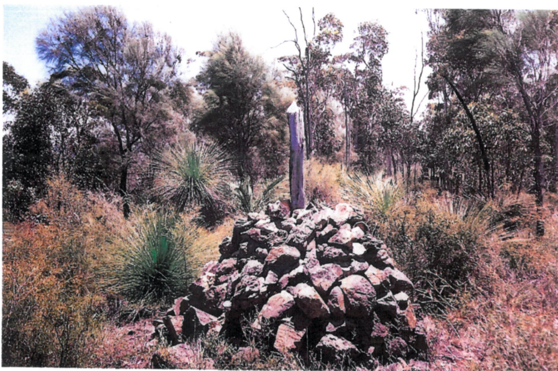
Original cairn and pole: Avon Valley Triangulation survey 1878.

This trail acknowledges Forrest's efforts to complete the 1877-78 survey by showing you the difficult terrain which had to be overcome and the rock cairns he placed at sites PV, SH as part of the survey.